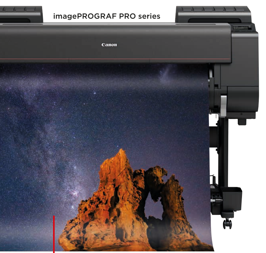
The high-end technology employed in imagePROGRAF large-format printers produces sharp prints in extraordinary detail — but only when printed with genuine inks from Canon.